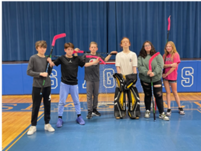
Second Place- Patriots