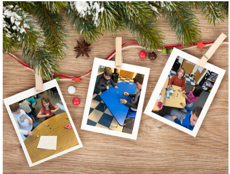
Second Graders playing dreidel