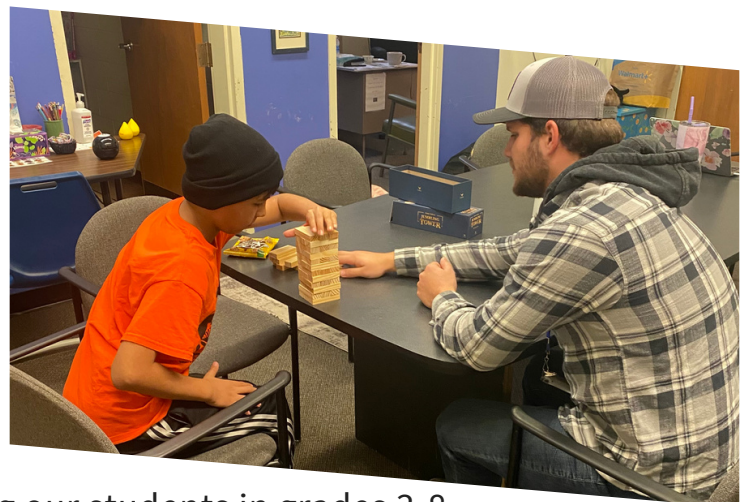
Students from UNE are mentoring our students in grades 3-8