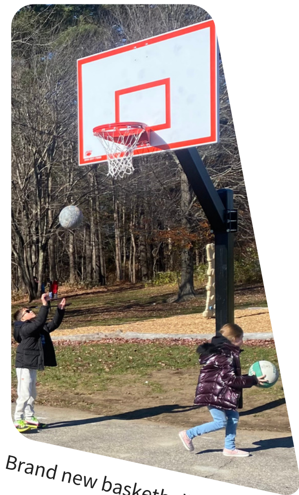
Brand new basketball hoop at LMS.