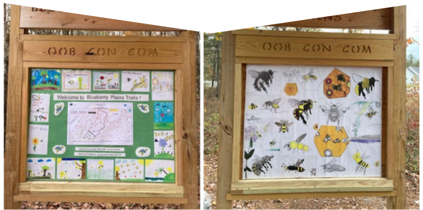
Summer Long Drive kiosk above, Pine Valley Road kiosk below