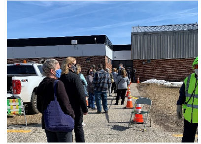
Wednesday was filled with excited people lining up at the Old Orchard Beach High School. They were excited to receive the Johnson & Johnson/Janssen COVID-19 vaccination!

very candid, "I wouldn't want to do this all day. Thank you to everyone here and those who helped set this day up." Words used to describe the Old Orchard Beach Vaccination Clinic included: "thrilled, fabulous, seamless, well done and thank you". Old Orchard Beach Paramedic/Firefighters were happy to assist residents and neighbors. One Paramedic remarked, "Some shed a tear after being vaccinated, others were looking forward to seeing extended family and grandchildren in the coming months. That was all the reward I needed."